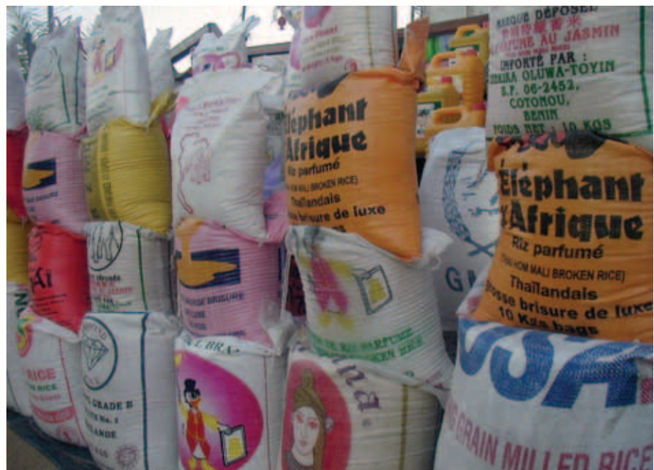
A growing concern: sub-Saharan Africa's heavy dependence on imported rice

This combined strategy will enable the Center, working in partnership, to make a significant contribution to the attainment of the Millennium Development Goals (MDG) and poverty reduction targets of NEPAD in SSA. ♦