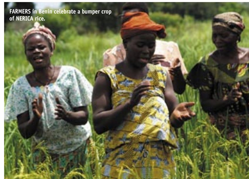
FARMERS in Benin celebrate a bumper crop of NERICA rice.