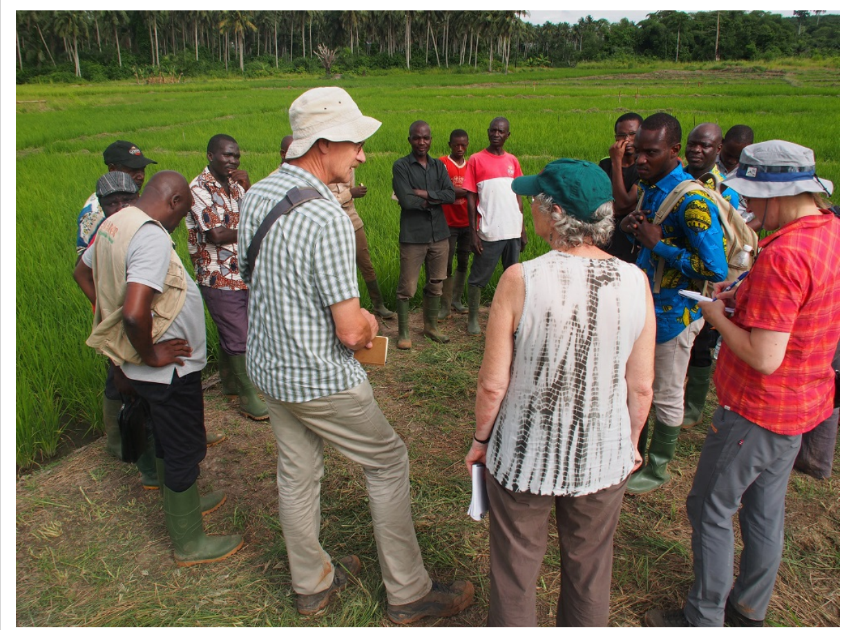
National and international researchers discussing with inland valley rice farmers about their priorities and constraints.