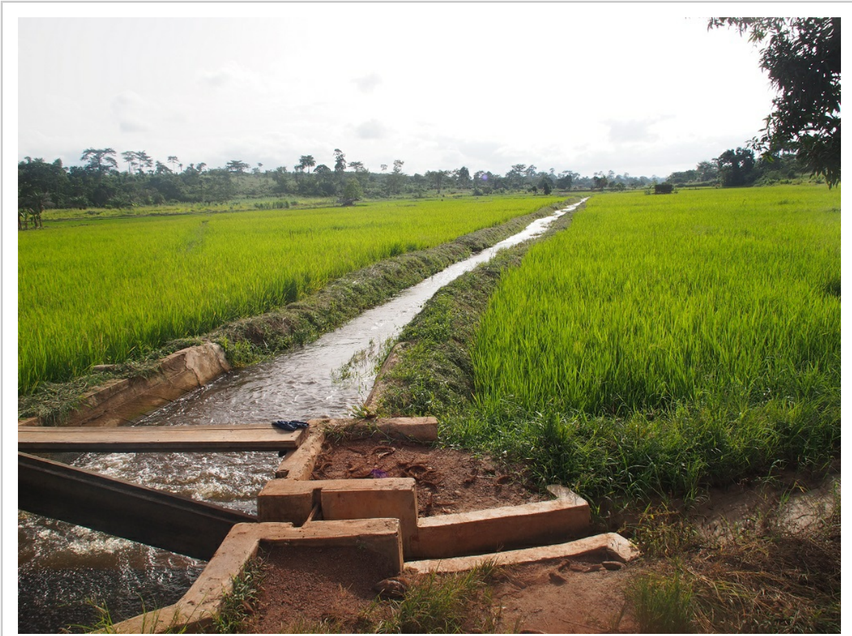
Rice is the only major crop that can be grown under the temporary flooded conditions in inland valleys.

Inland valleys are increasingly being considered as Africa's future food baskets and unlocking their vast potential through ecological management could make the continent self-sufficient in rice.