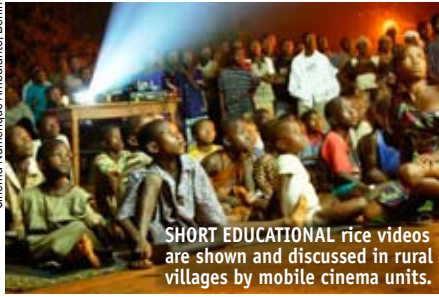
SHORT EDUCATIONAL rice videos are shown and discussed in rural villages by mobile cinema units.