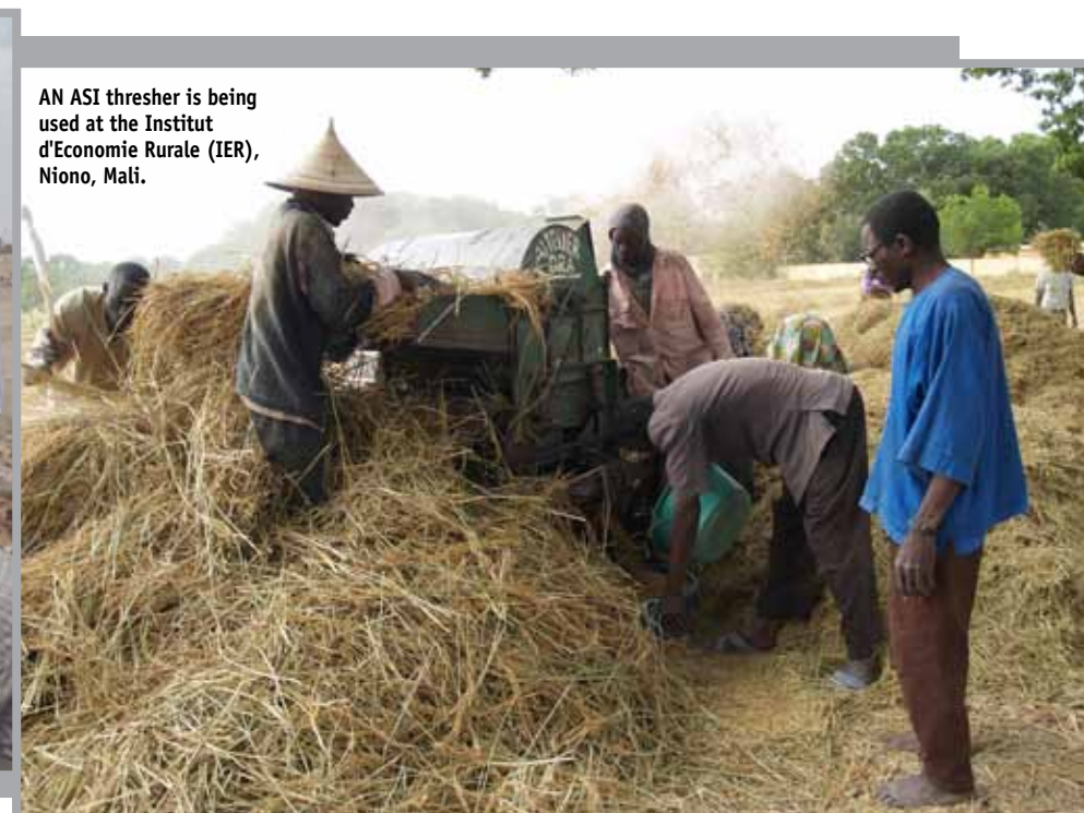
AN ASI thresher is being used at the Institut d’Economie Rurale (IER), Niono, Mali.